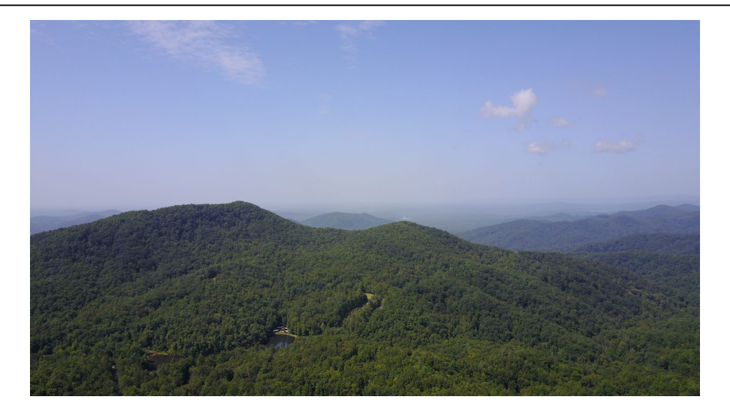
Camp McCall is owned and operated by the South Carolina Baptist Convention and is made possible through the churches of the South Carolina Baptist Convention and their giving through the Cooperative Program to impact the world.

Food or drink Cell phones, iPods, video games, etc. Personal valuables (including valuable clothes/shoes) Weapons of any kind Tobacco products, alcohol