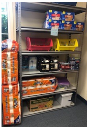
Beginning to stock the shelves for summer food ministry