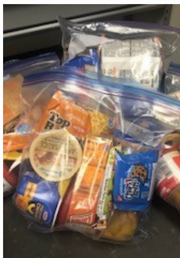
Filled bags for delivery

Be sure to check out the Heart4Schools website to learn more about providing food for hungry students: www.heart4schools.org .