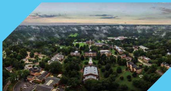
SOUTHEASTERN BAPTIST THEOLOGICAL SEMINARY