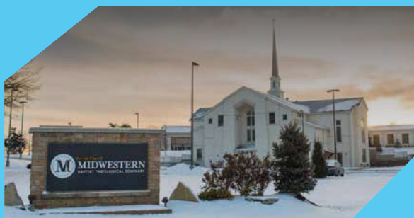
MIDWESTERN BAPTIST THEOLOGICAL SEMINARY