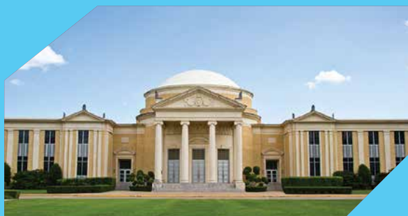
SOUTHWESTERN BAPTIST THEOLOGICAL SEMINARY