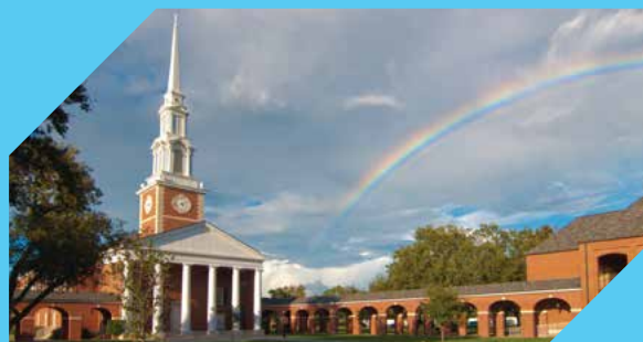
NEW ORLEANS BAPTIST THEOLOGICAL SEMINARY