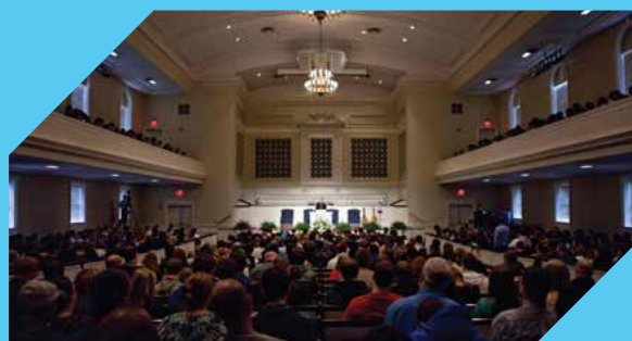
THE SOUTHERN BAPTIST THEOLOGICAL SEMINARY